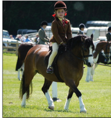
A show-winning turnout.