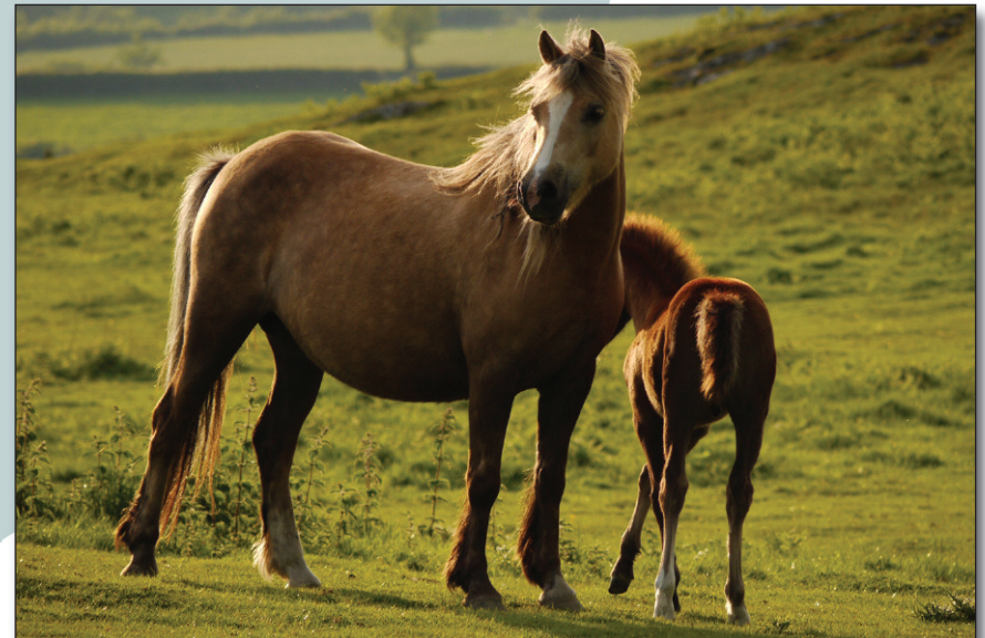
Eye-catching in the evening sunlight, Pwlle Adell with her foal.