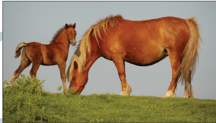
Right: Contrast of colours, Hope Miss Amber with her foal both gleam in the evening sunlight.