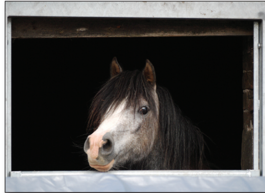
Watching yard activities over her stable door, the pretty filly Pentyrch Katrina.