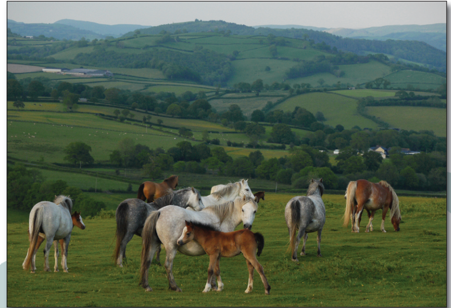
As the evening light fades over the Tywi Valley, mares and their foals of the Hope Stud catch the last sun rays of the day.