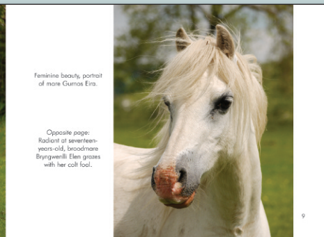
Feminine beauty, portrait of mare Gurnos Eira.